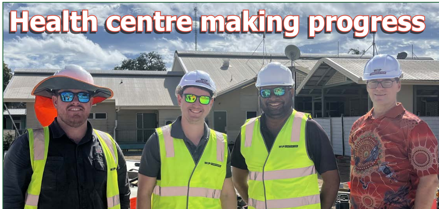
This month our Mayor and Councillors were invited to see how well the new health clinic was progressing after the second pour of concrete. The Mayor is pictured above with WIP construction and Qld Health.